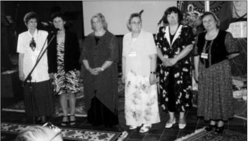
You can see the new committee of EBWU.