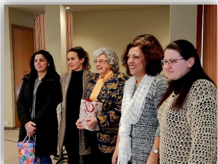
The Bulgarian national committee